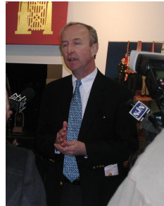
Congressman Rodney Frelinghuysen

On Friday, May 13, 2005, Department of Defense (DoD) Secretary Donald H. Rumsfeld announced the much-anticipated list of military base closings and consolidations to the Base Realignment and Closure (BRAC) Commission. Not only is Picatinny not on the BRAC list, but DoD has recommended that the installation should gain almost 700 positions as well as additional functions from bases that are scheduled to close.